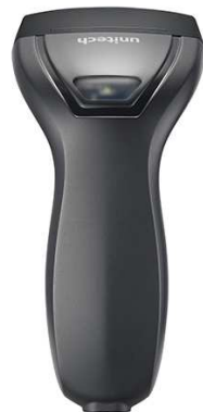
MS250 USB Scanner

Track'Em™ includes all of these powerful features: